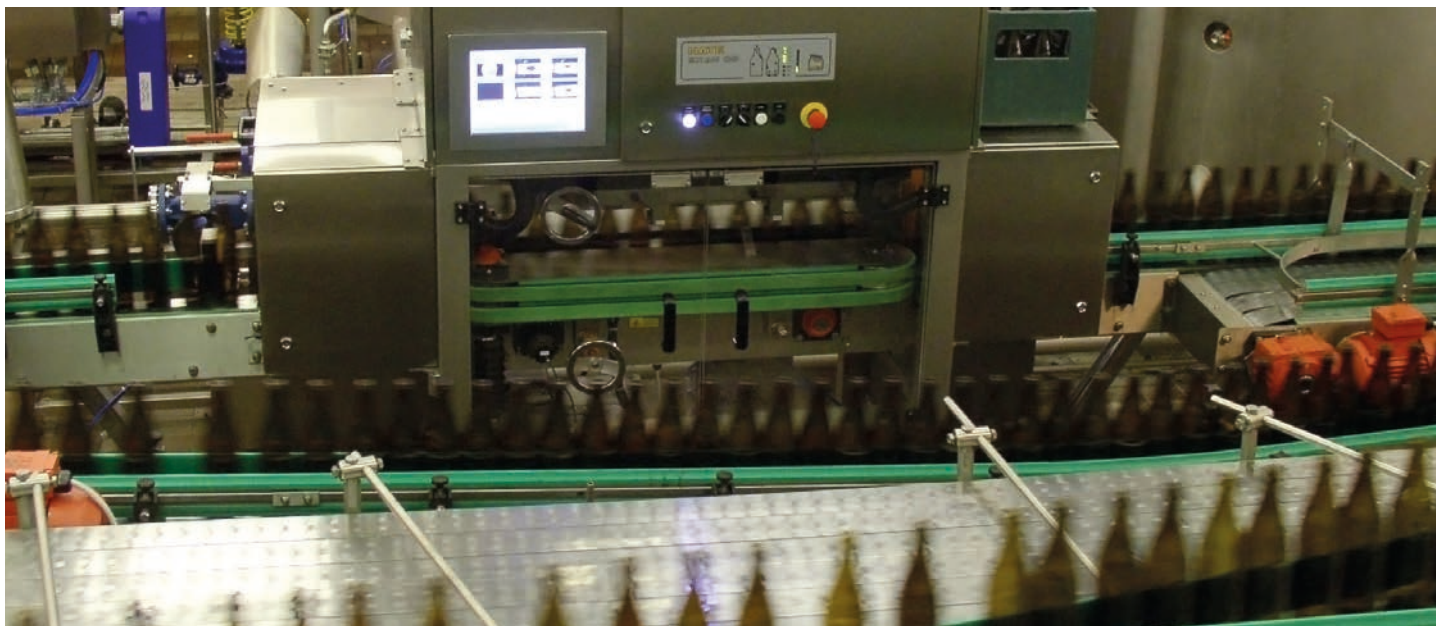
Bottling line equipped with a bottle inspection system

Litovel Brewery, PepsiCo CZ, Rychtář Brewery, Protivín Brewery, Korunní, Toma Teplice nad Metují, Samson Brewery, Trutnov Brewery, Jihlava Brewery Steiger - Vyhne (SK), Urpiner - Banská Bystrica (SK), Kirov (RU), Liepaja (LT), Jurajska (PL), Tervete (LT), Morshansk (RU), Piwniczanka (PL), APO Fruchsäfte (AT)