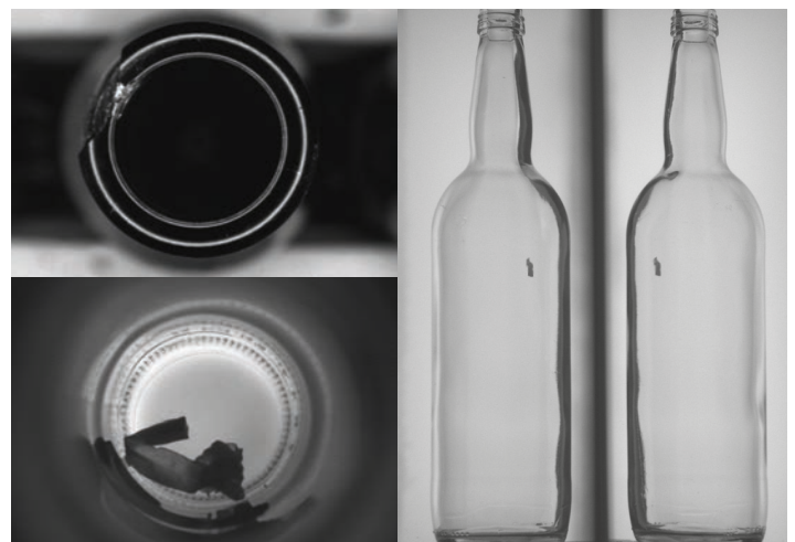
Detected defects on a bottle neck (left) and inside a bottle (right)