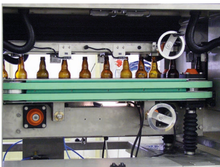
UniscanBOTTLE visual inspection system applied in industry